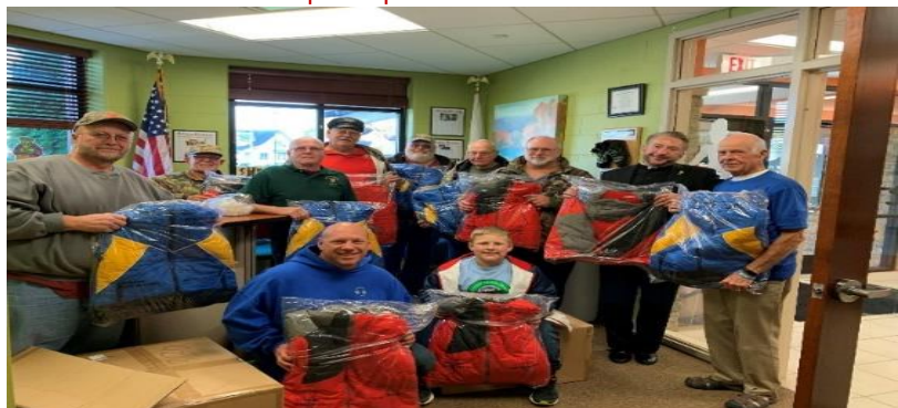
Berlin Council # 1547 participates in Coats for Kids distribution